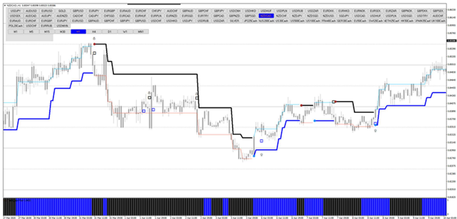
Cristal with Stop and Reverse