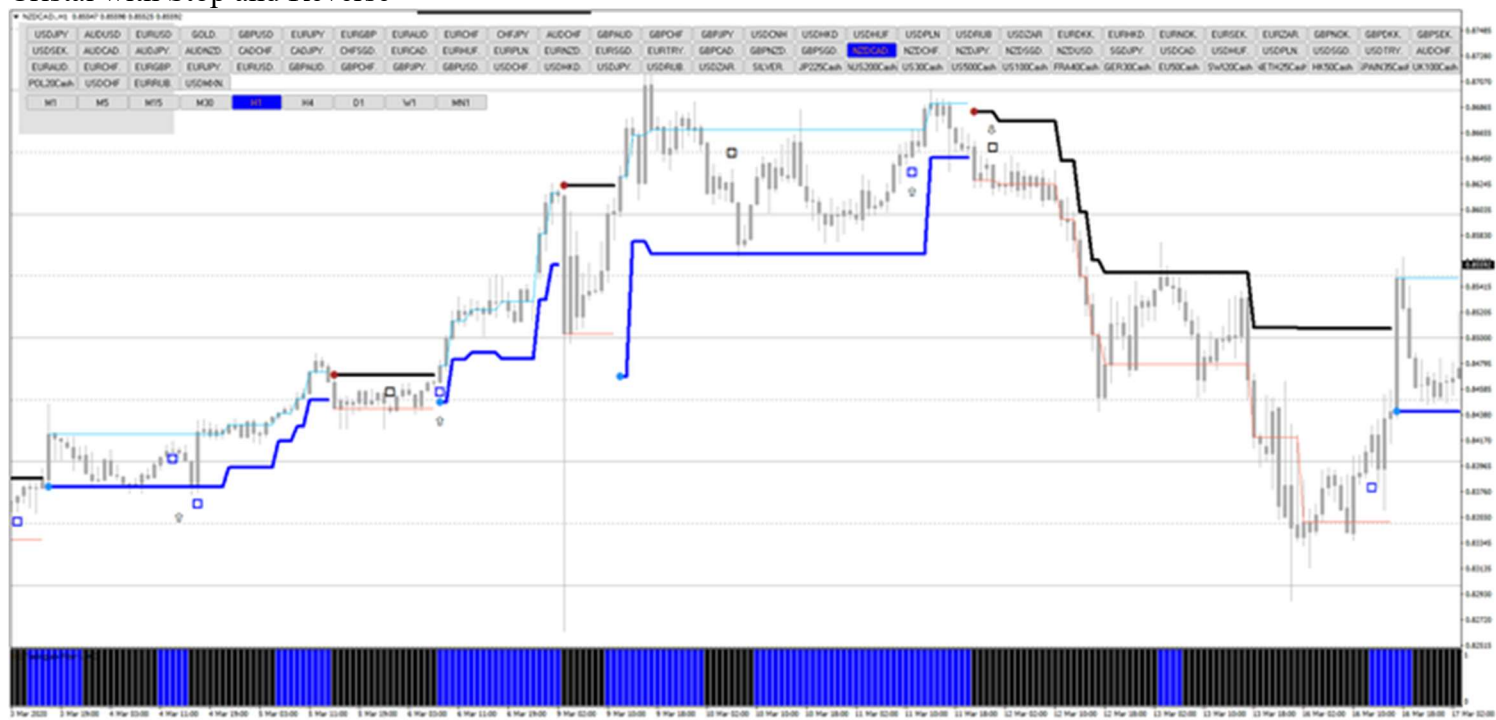
Cristal with Stop and Reverse