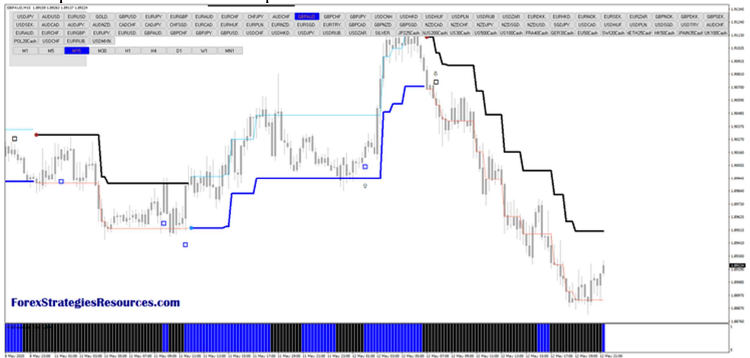
Cristal with Stop and Reverse

In the pictures Cristal with Stop and Reverse in action.