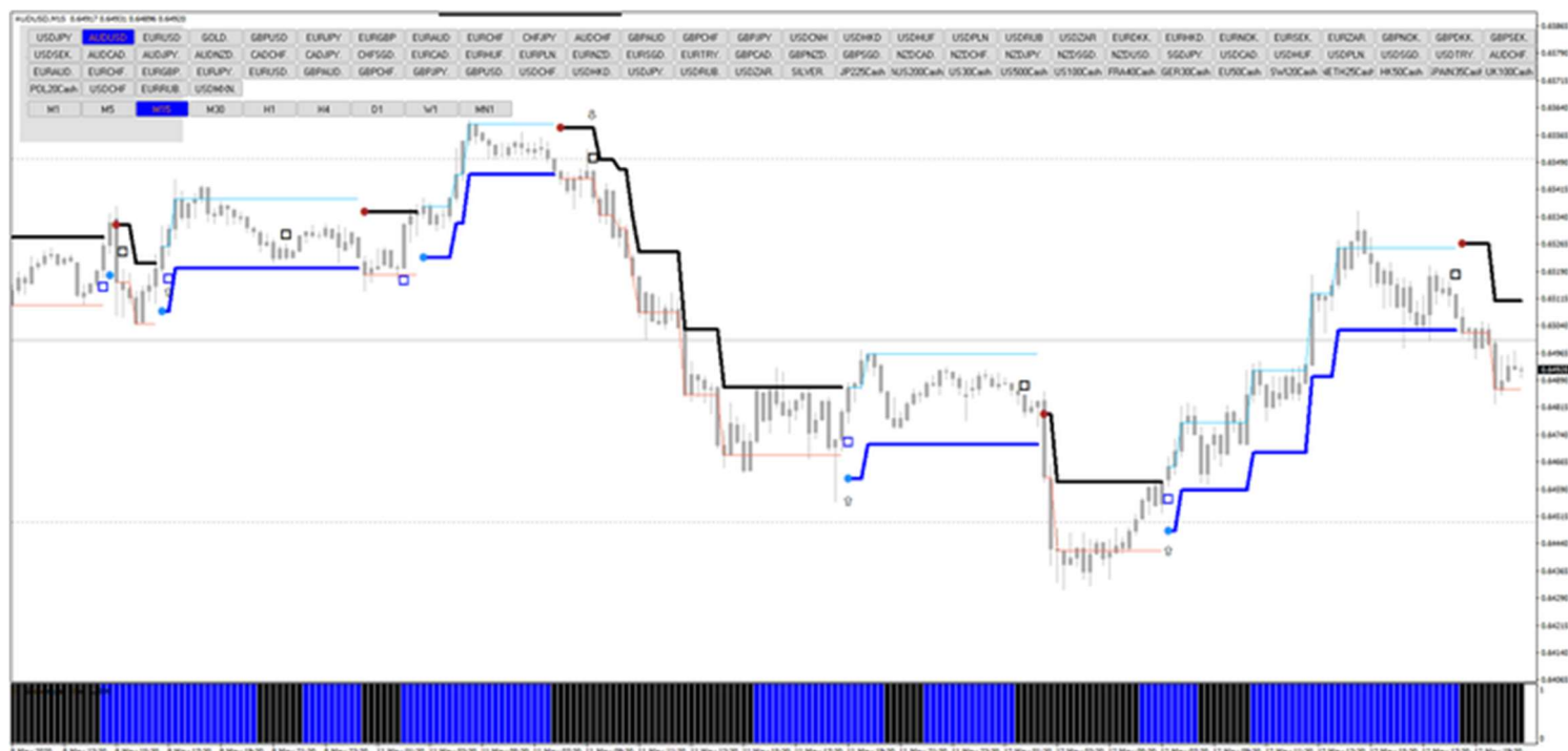
Cristal with Stop and Reverse